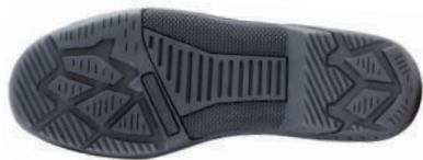
■ BK LA- OS507